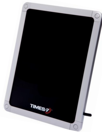
The SlimLine A6031